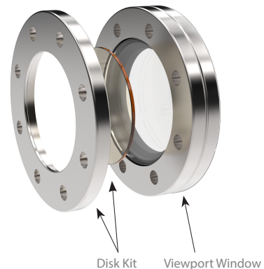
*Viewport Window Not Supplied